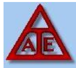
Anderson Tool & Engr