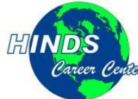
Hinds Career Center